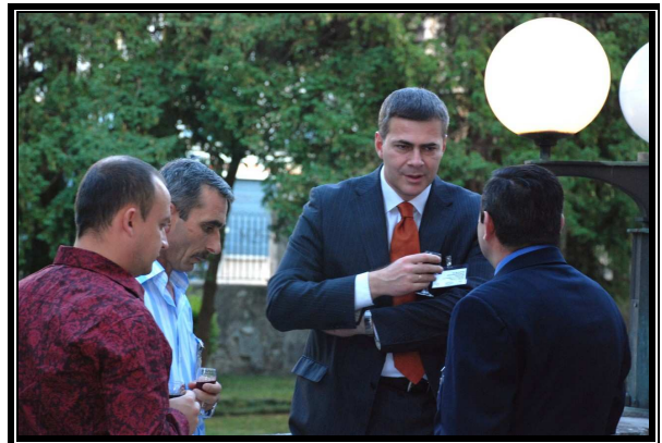
Assistant Minister for Material Resources in the MoD of the Republic of Serbia, Mr. Ilija Pilipović, during a relaxed discussion with the Albanian delegation

Subsequently, attention was drawn to the fact that besides becoming obsolete for technical reasons, e.g. through aging, new amounts of excess weapons and ammunition are created through the normal process of armed forces restructuring. Therefore, the frequently present opinion that the process of excess weapons and ammunition disposal is relatively short, with a clear end in sight, is misleading and inadequate as it may result in reluctance to commit funds to disposal capacities development. On the contrary, creation of surplus weapons and ammunition in armed forces is a normal and constant process and, thus, disposal capacities and processes have to be a standing part of the armed forces' structure and procedures.